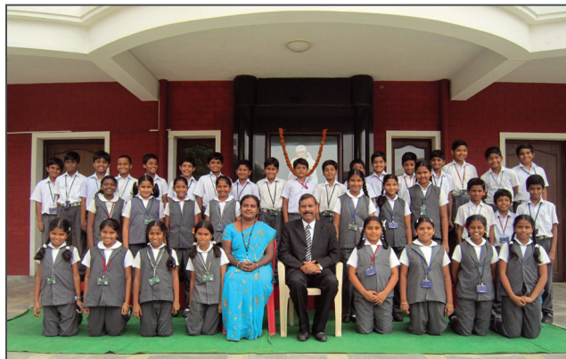
V - ORCHIDS