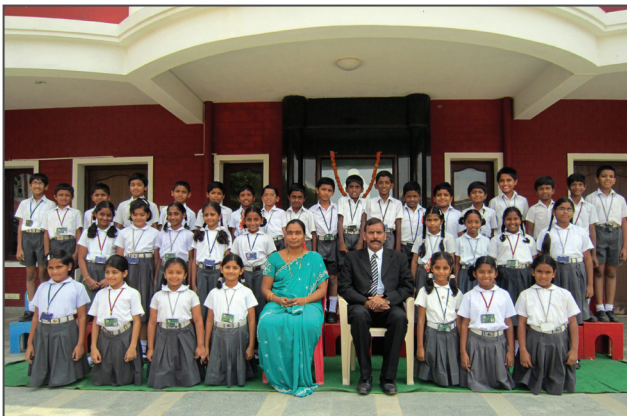
IV - IRISES