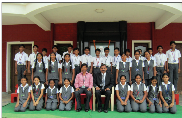
VII - IRISES