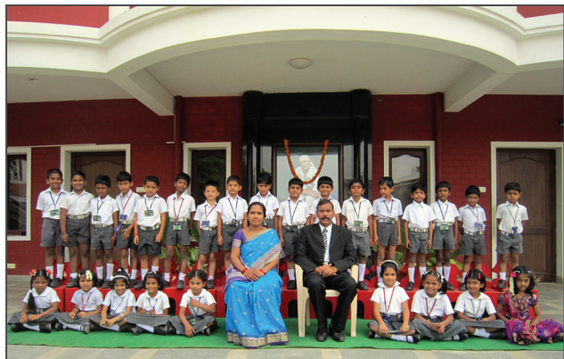
I - DAFFODILS