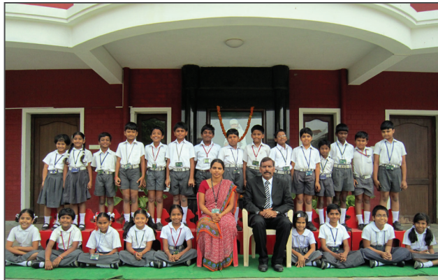
III - TULIPS