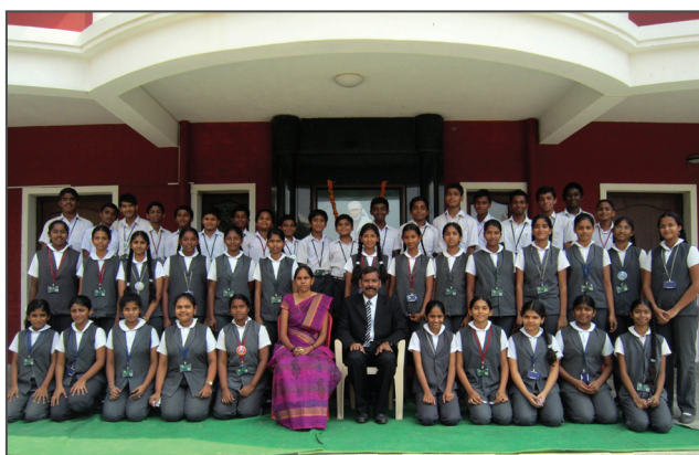
VII - DAFFODILS