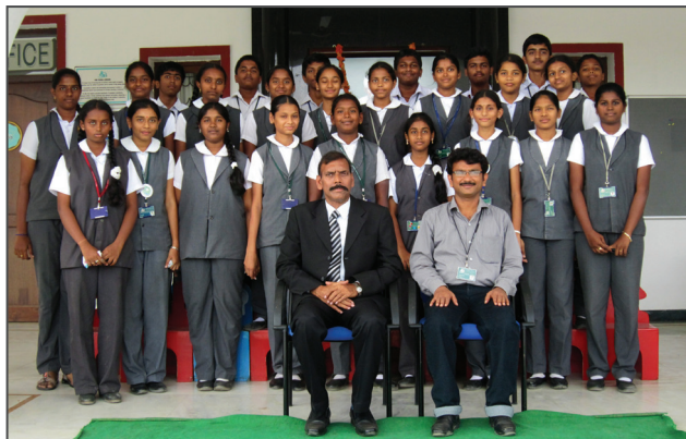
IX - DAFFODILS