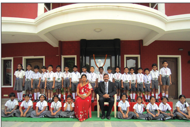
II - DAFFODILS