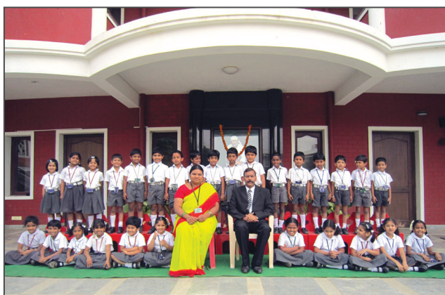
I - ORCHIDS