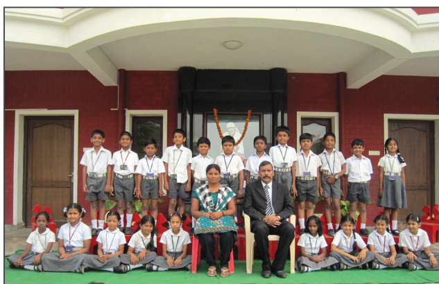
III - DAFFODILS