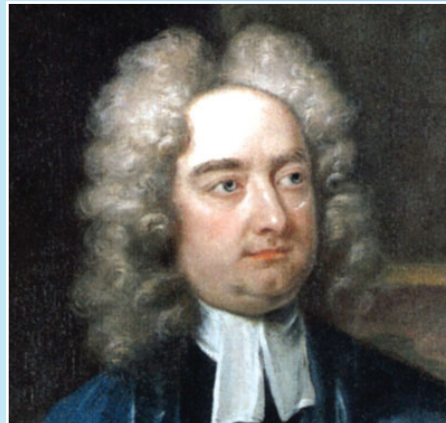
J O N A T H A N S W I F T

bio-sketch. On the appointed day, a quiz on the author was conducted amongst the four houses. The quiz comprised of three different rounds - Pass On round, Rapid Fire round and a Visual round. The preparation helped the children to get well acquainted with the story and its various events thus enabling the young minds crave for more reading. The pictures in the visual round checked whether the children were thoroughly familiar with the book. They enthusiastically identified each picture giving the context. Mahatma House won the first place and the second place was bagged by Einstein house in the quiz.