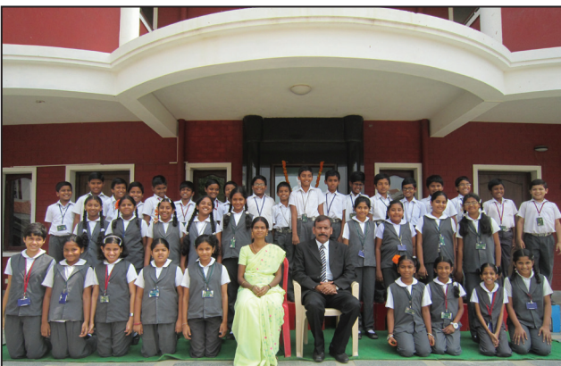
V - DAFFODILS