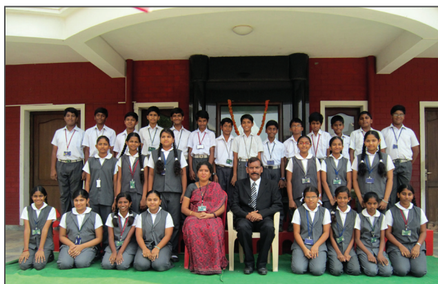
VII - DAFFODILS