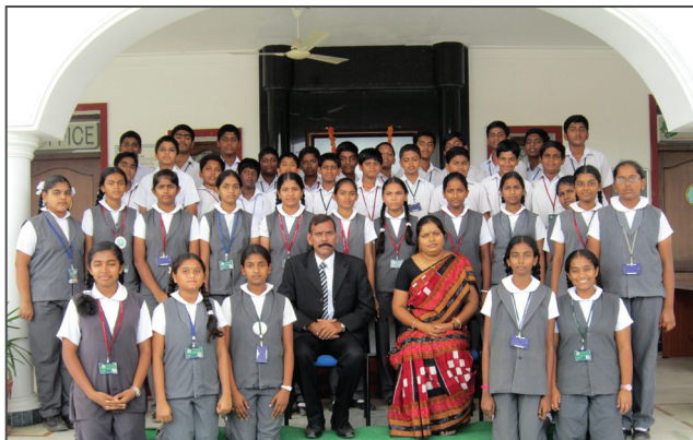
VIII - IRISES