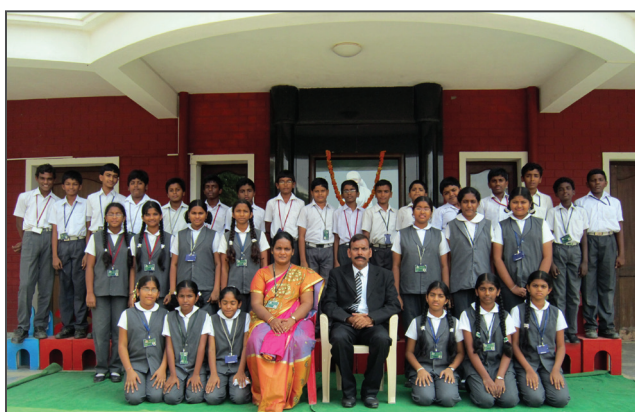
VII - ORCHIDS