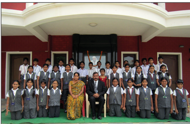
V - IRISES