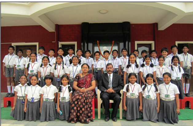
IV - ORCHIDS