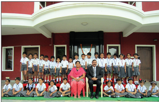
I - IRISES