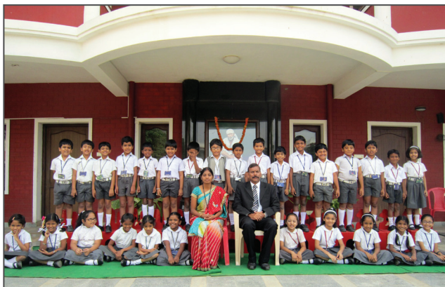
II - IRISES