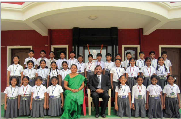
IV - DAFFODILS