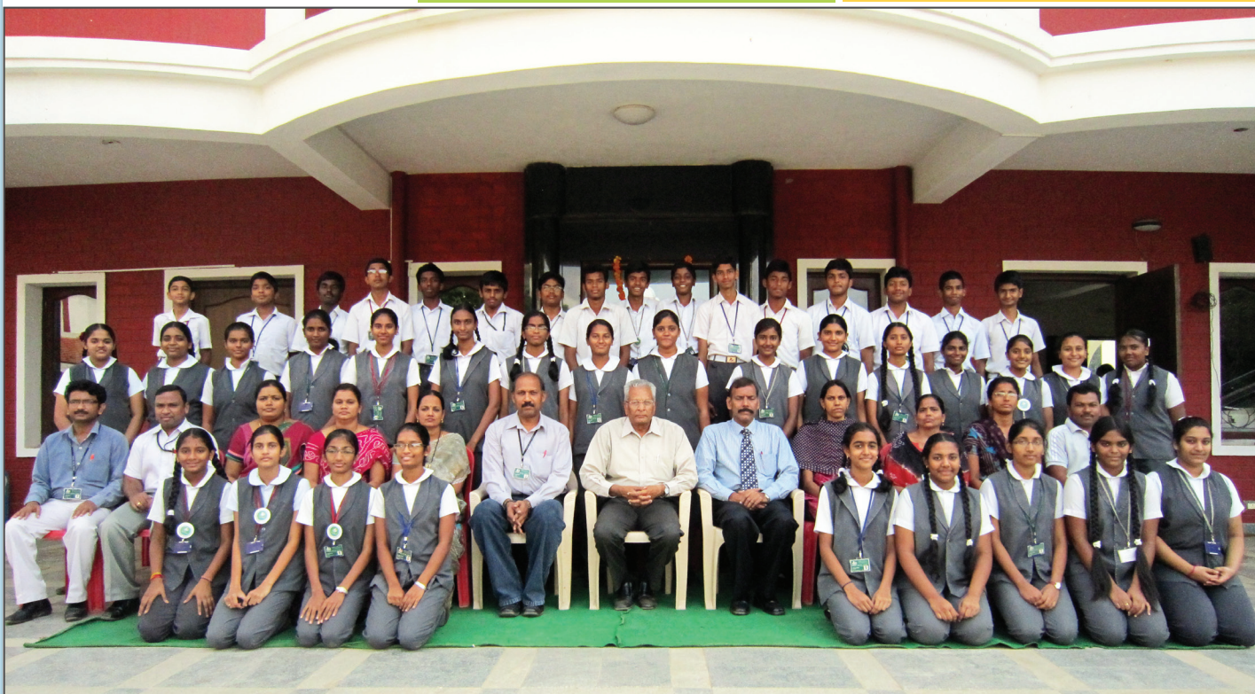
X - CLASS