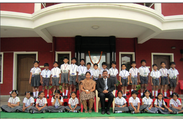
II - ORCHIDS