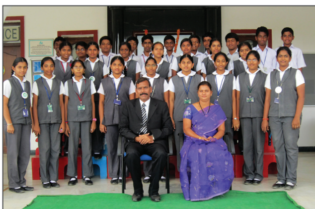
IX - IRISES