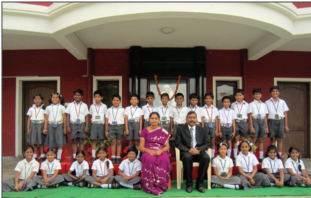
III - ORCHIDS