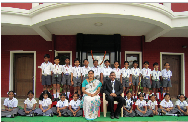
III - IRISES