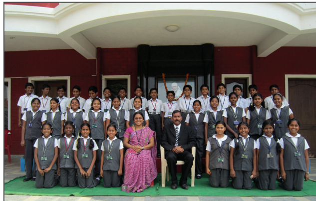
VI - DAFFODILS