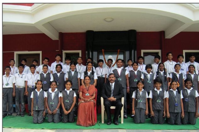
VI - ORCHIDS