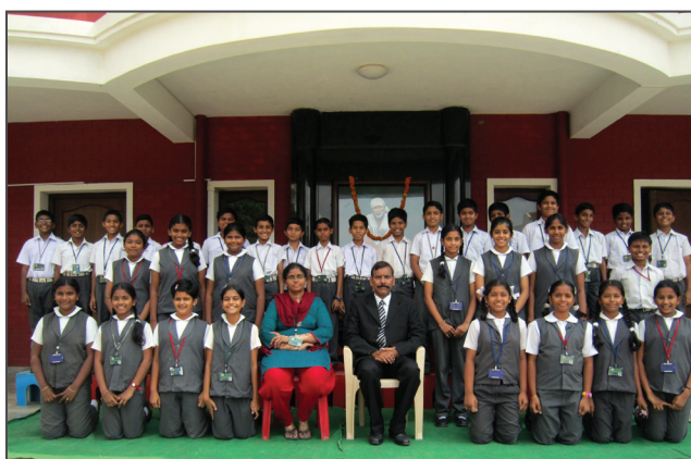
VI - IRISES