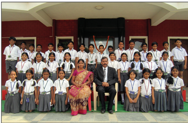
IV - TULIPS