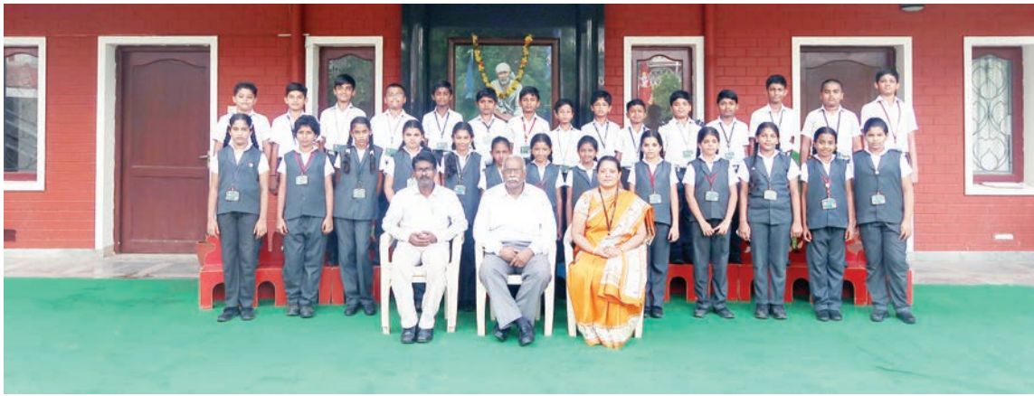
VI - Tulips