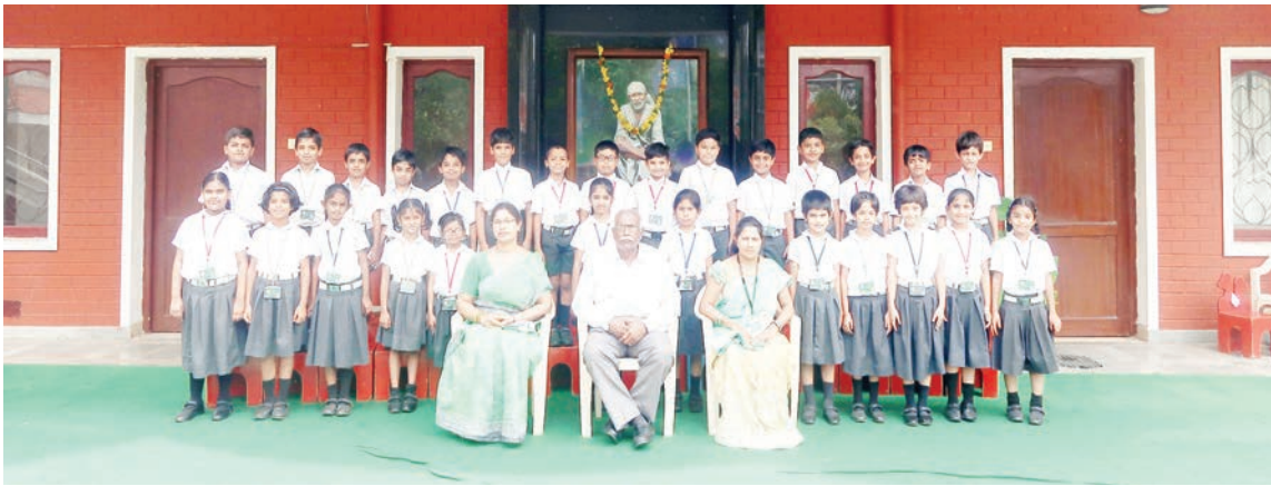
III - Irises