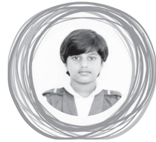
M V Snehita VI Daffodils Adm. No. 3565

Many of them use their mobile phones while driving without following traffic rules and they put their lives at risk as well as others. Therefore, mobile phones should be banned in all schools and colleges so that no student will bring their mobile phones to school or colleges. The parents must be vigilant at all times when their children carry mobile phones outside or inside the house.