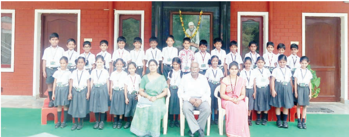
III - Tulips