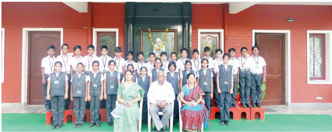
V - Irises