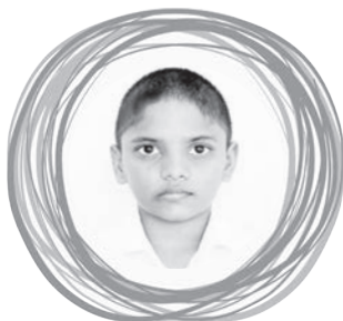
N. Subhash VIII Irises Adm. No. 3924

The industry needs skilled labour. The government should put focus on the study of science and technology. It's the time to open more and more technical institutes, vocational courses, market oriented subjects, courses in advanced computer applications, information technology, bio technology in schools and colleges. Only then we will be able to keep pace with the rapidly progressing world and turn India into skilled India.