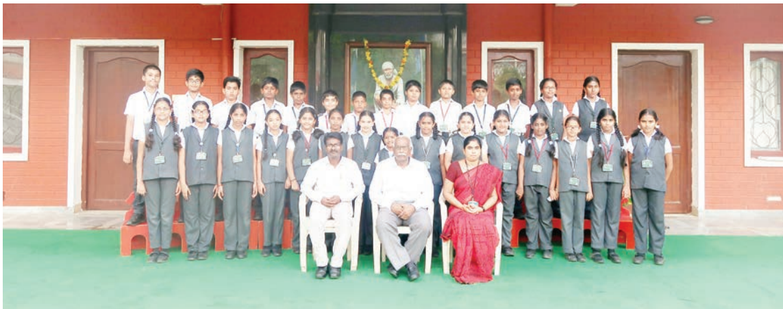
VI - Irises